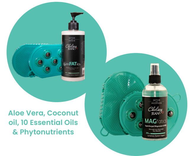
Aloe Vera, Coconut oil, 10 Essential Oils & Phytonutrients