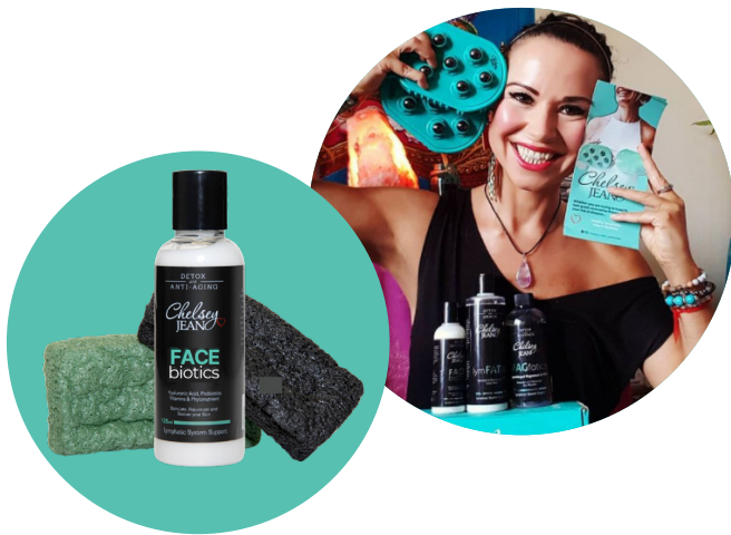
FACEbiotics 125ml DETOX & ANTI-AGING